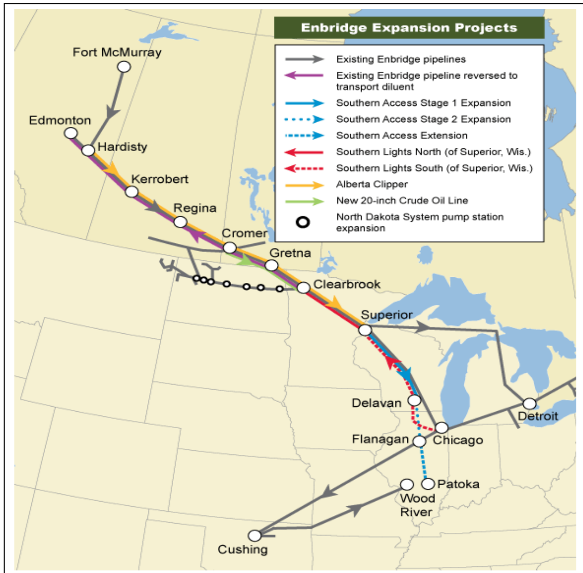
Figure 2: Enbridge Pipeline Expansion