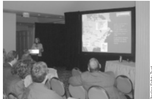
Attendees view a presentation at the conference.

The Trust hopes to continue to foster communication surrounding pipeline safety with future conferences. As of this printing, the next conference is tentatively scheduled for November of this year. ■